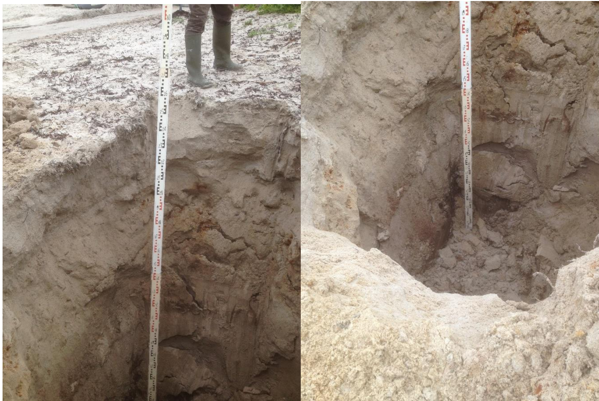
Fig 4 and 5 Pit 2 Porth Mellon