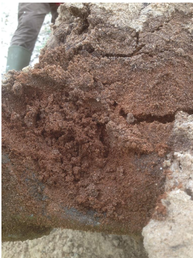
Fig 7 – Medium grained sand at base of pit