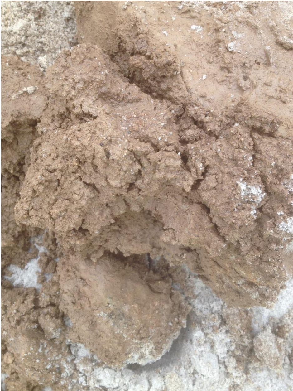
Fig 3 – Trial Pit 1 – Sand / Gravel / Clay composite