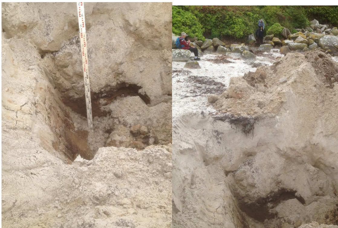
Figs 1 and 2 – Trial Pit 1 Porth Mellon

0 (base of pit) – 0.5 Ram - sand, gravel and clay composite deposit (firm/stiff to dense/compact)